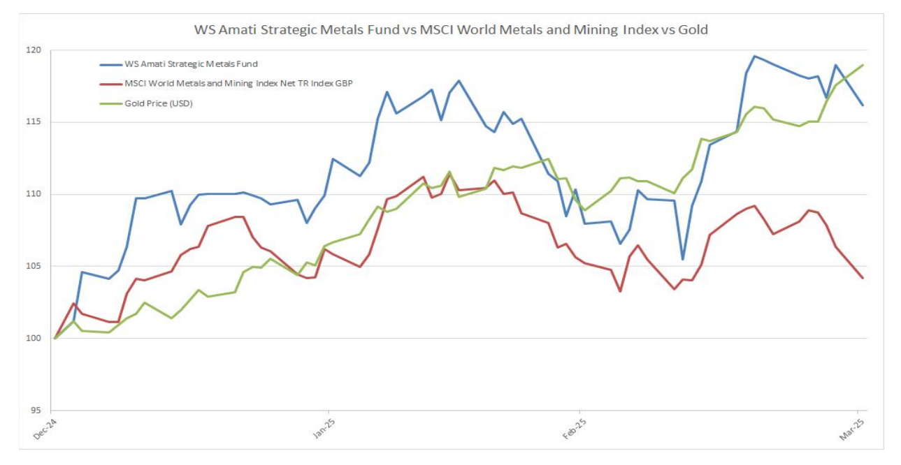
Figure 1 – Fund Performance vs Base Metals & Gold

The fund was up by 16.2%, against the benchmark that was up by 4.2%. The performance was largely driven by a high (65-70%) exposure to precious metals in the fund, mostly in the mid-cap and developers, while keeping the optionality to the battery metal sector at around 16%. We believe that the battery metals sector (lithium, graphite and nickel) offers the most upside potential, given how oversold the sector is and the fact that commodity prices are finding a floor at current levels, which remain well below the levels required to incentivise new supply. However, sentiment towards the sector remains very weak and could remain so in the short-to-medium term. We also used the opportunity of the weakness in spot uranium prices and uranium equities to reintroduce a uranium position into the Fund.